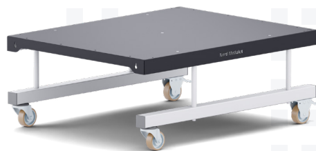
Nord Cart 300-385